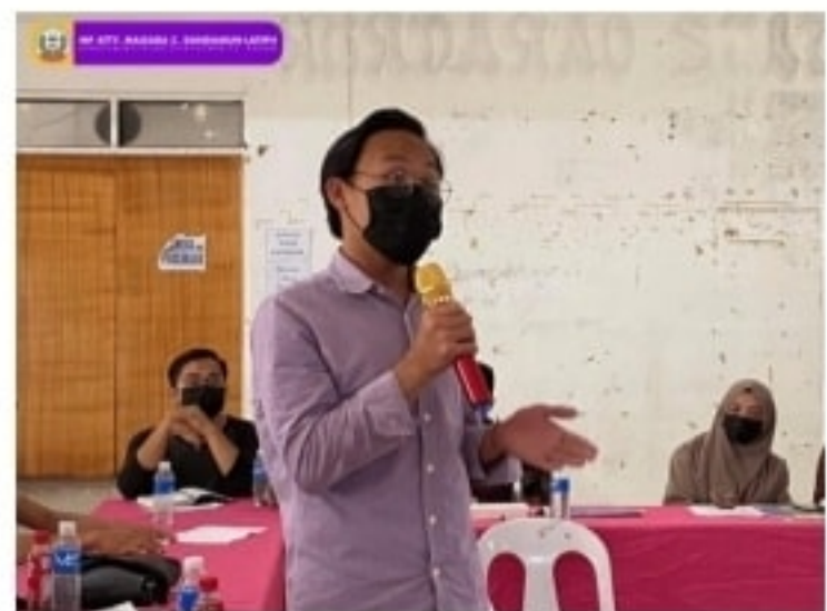
Photo taken during the consultation with the youth in Lanao del Sur