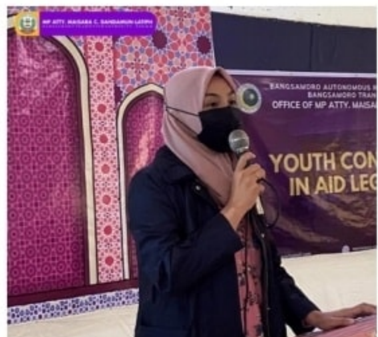
Photo taken during the consultation with the youth in Lanao del Sur