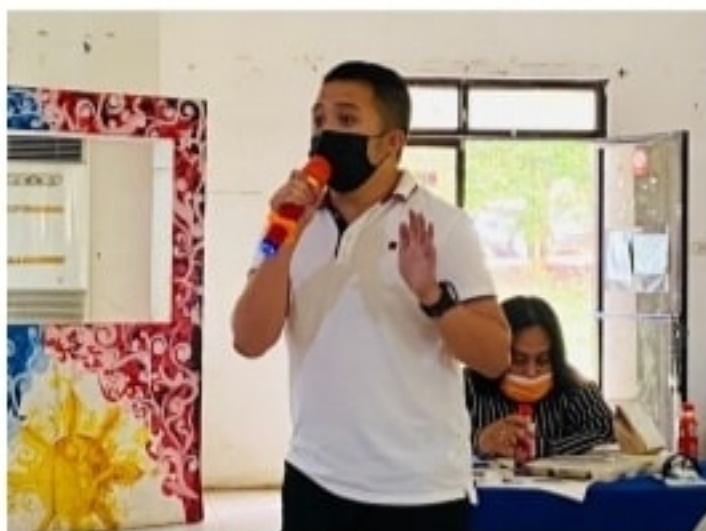
Photo taken during the consultation with the youth in Lanao del Sur

Under the Bangsamoro Organic Law (BOL), Article IX-Basic Rights, Section 13-Rights of the Youth-The Bangsamoro Government shall recognize the vital role of the youth in nation-building, promote and protect their physical, moral, spiritual and nationalism, encourage involvement in public and civic affairs, and promote mental and physical fitness through sports. The Parliament shall create by law a commission on youth affairs and shall define its powers, functions, and compositions.