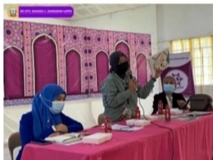
Photo taken during the consultation with the youth in Lanao del Sur

Two years after the conflict, some 76,719 people returned to Marawi, while about 47, 715 individuals remained in South Lanao or migrated to other provinces or regions. In terms of education, only 37% of the school-age populations is in school, while the rest, mostly young, are either out of the system, or of working age but unemployed.